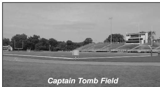
Captain Tomb Field

hunt in 2006, their final year of competition in the Skyline Conference. Entering the 2007 campaign, USMMA will become a member of a new eight-team conference consisting of Goucher College, Juniata College, Moravian College, Susquehanna University, Catholic University, Drew University and Stevens Institute of Technology.