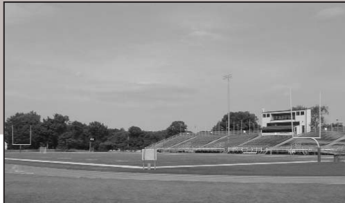
USMMA Lacrosse plays its home games on the FIELD TURF at Captain Tomb Field at Brooks Stadium.